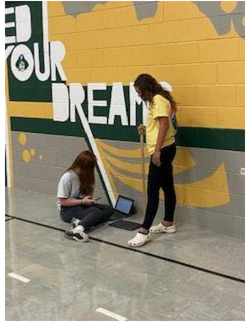
Geometry class finding the surface area of our cafeteria. They had to use the height and width of each block to estimate the area of each wall, the floor, and the ceiling.