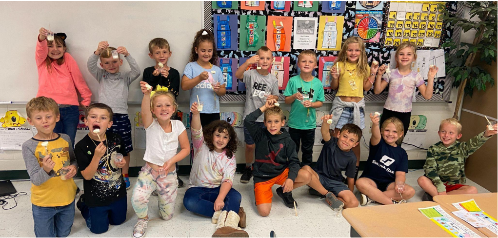
Our second grade classes made biodegradable plastic with corn oil in social studies!